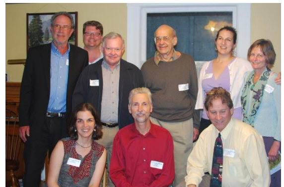
EcoViva Board Retreat 2012